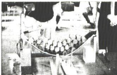
This fully loaded bridge was a carb-

Prize winners included South Brunswick High School (1st Place), Summit